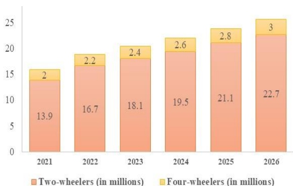
Figure 1. Vehicle population growth [5, 6].

In India, the researchers have mostly concentrated on the technical feasibility of the ethanol blending in conventional petrol engines, but there is still a lack of knowledge on the challenges of ethanol blending program's effective implementation and the impact of various policies on the usage of ethanol in India. Thus additional research is required to examine the various policies impacting ethanol production and distribution in the country. This study aims to provide valuable insights into the challenges and opportunities of ethanol blending in India and recommend actionable steps for policymakers, industry stakeholders, and researchers to address these gaps.